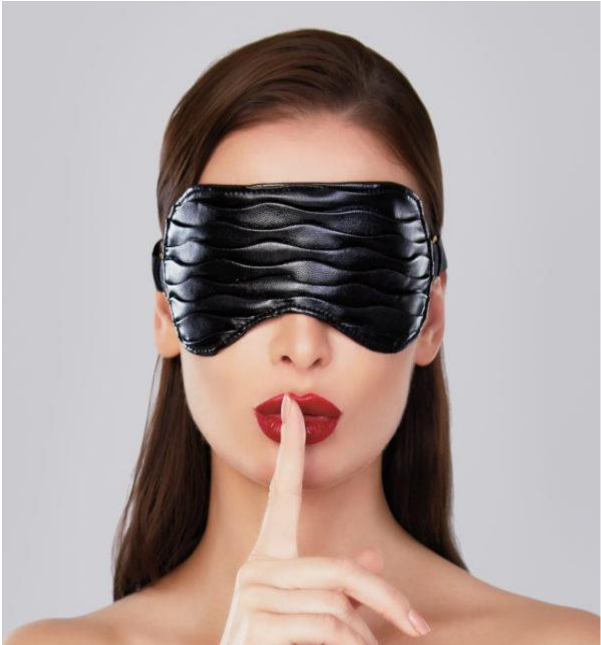
A1067 – The Love Mask