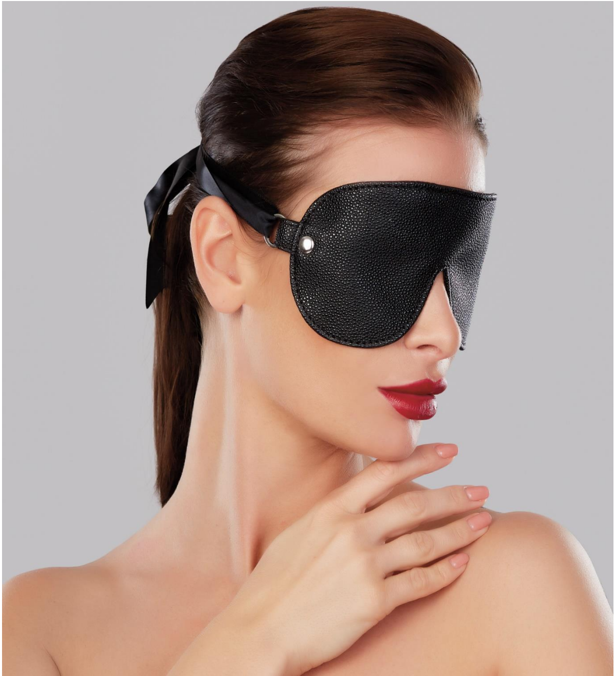
A1084 – Seduce Me Mask